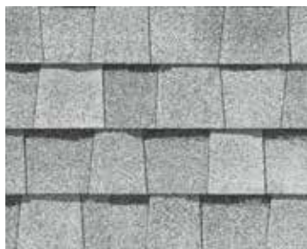
Silver Birch CRRP Product ID 0668-0072