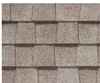
Solaris Mojave Tan CRRP Product ID 0668-0115