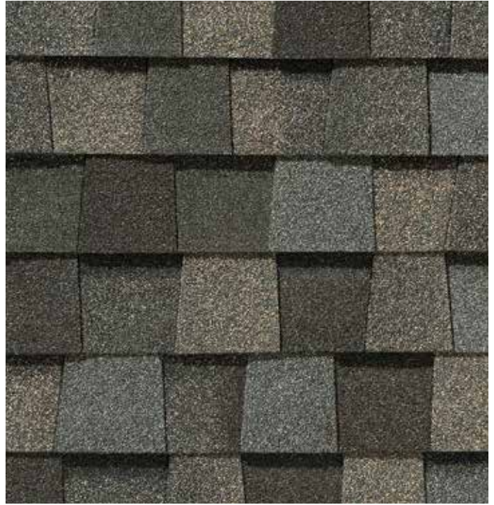
Max Def Weathered Wood