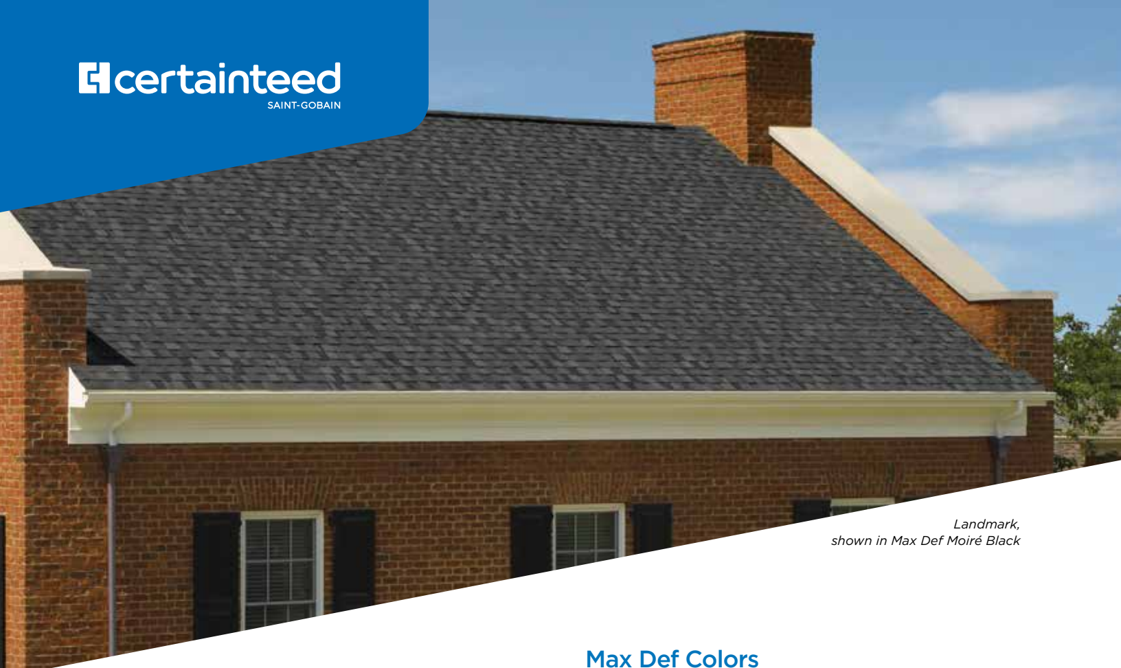
Landmark, shown in Max Def Moiré Black