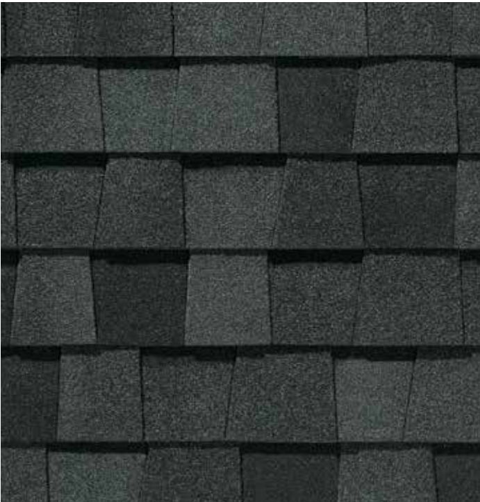
Max Def Moiré Black