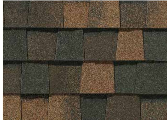
Max Def Burnt Sienna