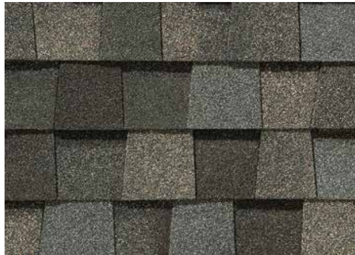
Max Def Weathered Wood