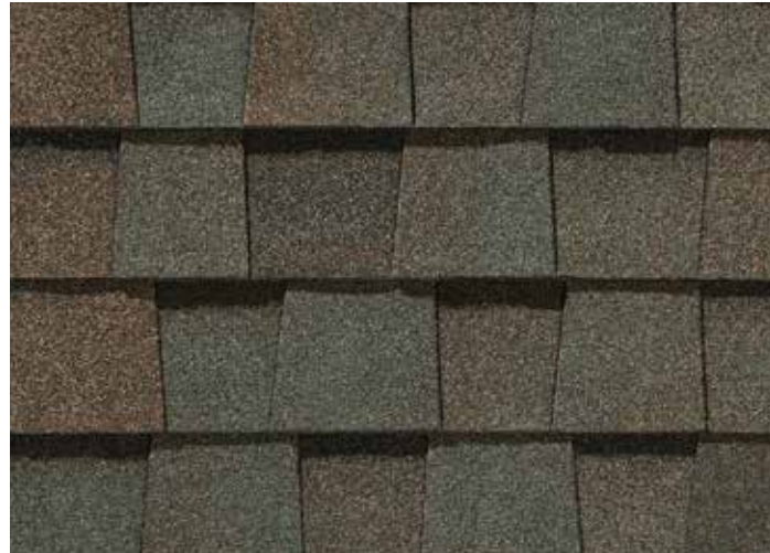
Max Def Heather Blend

Look deeper. With Max Def, a new dimension is added to shingles with a richer mixture of surface granules. You get a brighter, more vibrant, more dramatic appearance and depth of color. And the natural beauty of your roof shines through.