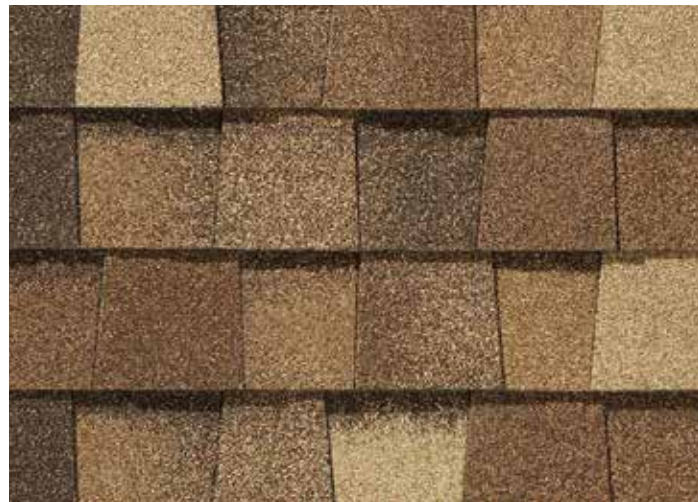
Max Def Resawn Shake