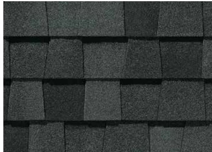
Max Def Moire Black