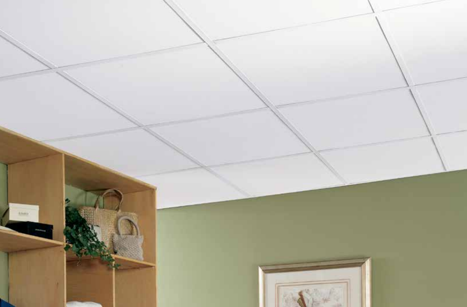
Symphony® g IOF Trim (1112-IOF-1)