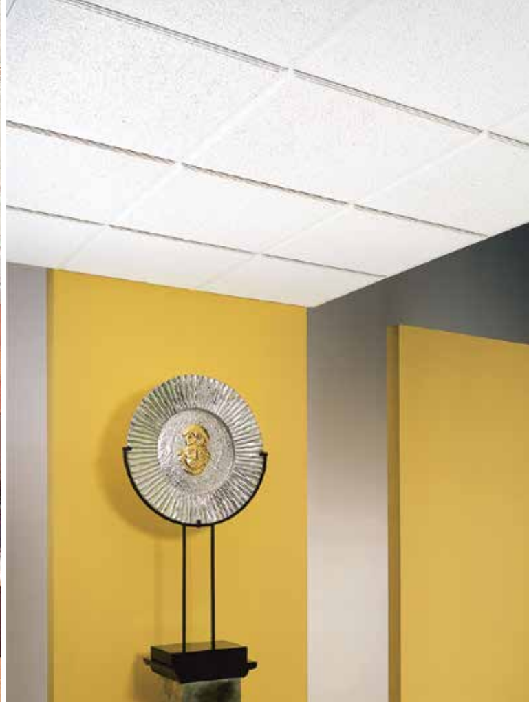
Cashmere Style Edge Tier Reveal (CMTS-124)