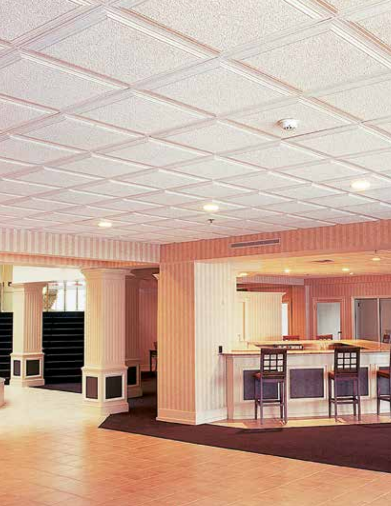
Cashmere® Style Edge Fluted Reveal (CMF-124)