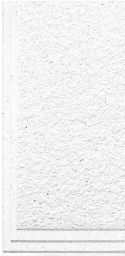
Tier Reveal Edge