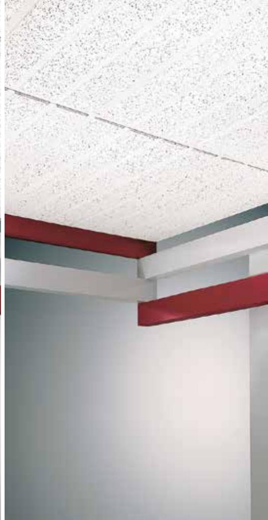
Baroque Customline Reveal (BQCL-448)