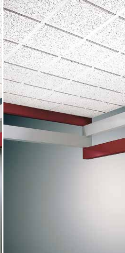
Baroque Customline Reveal (BQCL-812)