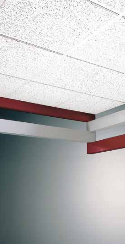
Baroque™ Customline® Reveal (BQCL-224)