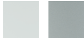
Lighthouse White 0401 Natural 7080