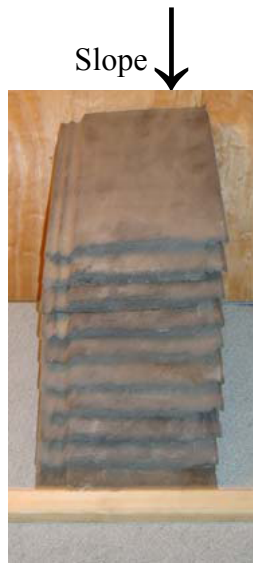
Front View Figure 2: Batten Method