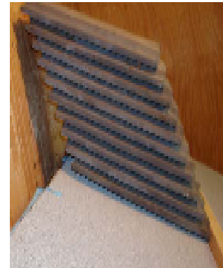
Side View Figure 2: Batten Method