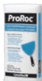
ProRoc® Satin Coat All-Purpose Compound Code: 309074 10 kgs / 22 lbs • Air drying compound • For embedding paper tape, finishing joints, fasteners and trim on gypsum wallboard • Easy to mix and sand

ProRoc® Brand Satin Coat All-Purpose Powder Compound provides a high quality drywall joint finish from a powder ready-to-mix product. Storage of product in cold conditions will not affect performance. Use to embed paper tape, conceal and finish joints, fasteners, and trim accessories on gypsum wallboard when the convenience of a single finishing product is desired. May be applied with either hand or mechanical tools.