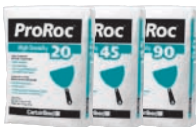
ProRoc® High Density 20 minute - Code: 309055 45 minute - Code: 309083 90 minute - Code: 309084 15 kgs / 33 lbs • High Strength Setting Compound • Non-sandable • Low shrinkage • Use for embedding tape, heavy fills and repairs • Exceptional strength

ProRoc® Brand High Density Setting Compounds are recommended for heavy fills or when exceptional bond is necessary. Once dry the product is not easily sanded. It is specially formulated to harden with very little shrinkage. Setting times are available from 20 minutes to 90 minutes.