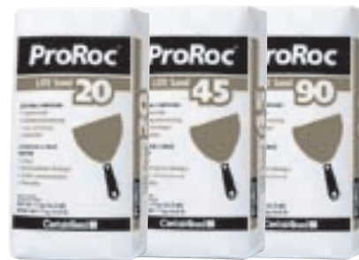
ProRoc® LITE Sand 20 minute - Code: 309076 45 minute - Code: 309078 90 minute - Code: 309079 11 kgs / 24.25 lbs • Lightweight formulation • Chemical hardening • Low shrinkage • Sandable