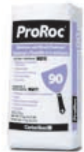
ProRoc® Moisture and Mould Resistant 90 with M2Tech® 90 minute - Code: 312908 11 kgs / 24.25 lbs • Part of the M2Tech® system of products • Moisture and Mould Resistant • Lightweight • Chemical hardening • Low shrinkage • Sandable

ProRoc® Brand LITE Sand Setting Compounds are lightweight sandable chemically setting powders used to prefill joints, embed mesh joint tape and conceal joints, fasteners and trim accessories on gypsum wallboard. They can also be used for interior patching and repair. They are ideal for heavy fills because they are specially formulated to harden with very little shrinkage in a prescribed time frame. Setting times are available from 20 minutes to 90 minutes.