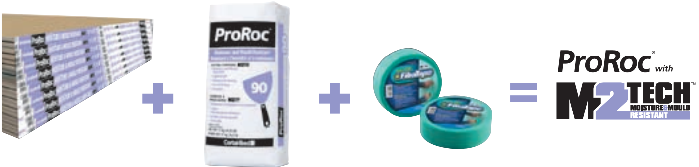
ProRoc® Moisture and Mould Resistant Gypsum Board with M2Tech®