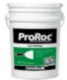
309201 18L Pail