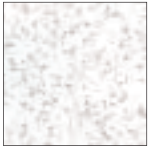
WHITE OVERTONE® – OVT-1