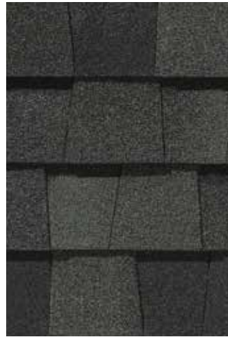
Max Def Moire Black