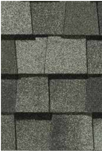
Max Def Granite Gray