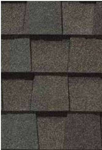
Max Def Heather Blend