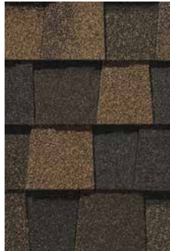
Max Def Burnt Sienna

NOTE: Due to limitations of printing reproduction, CertainTeed can not guarantee the identical match of the actual product color to the graphic representations throughout this publication.