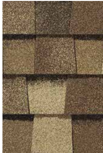
Max Def Resawn Shake