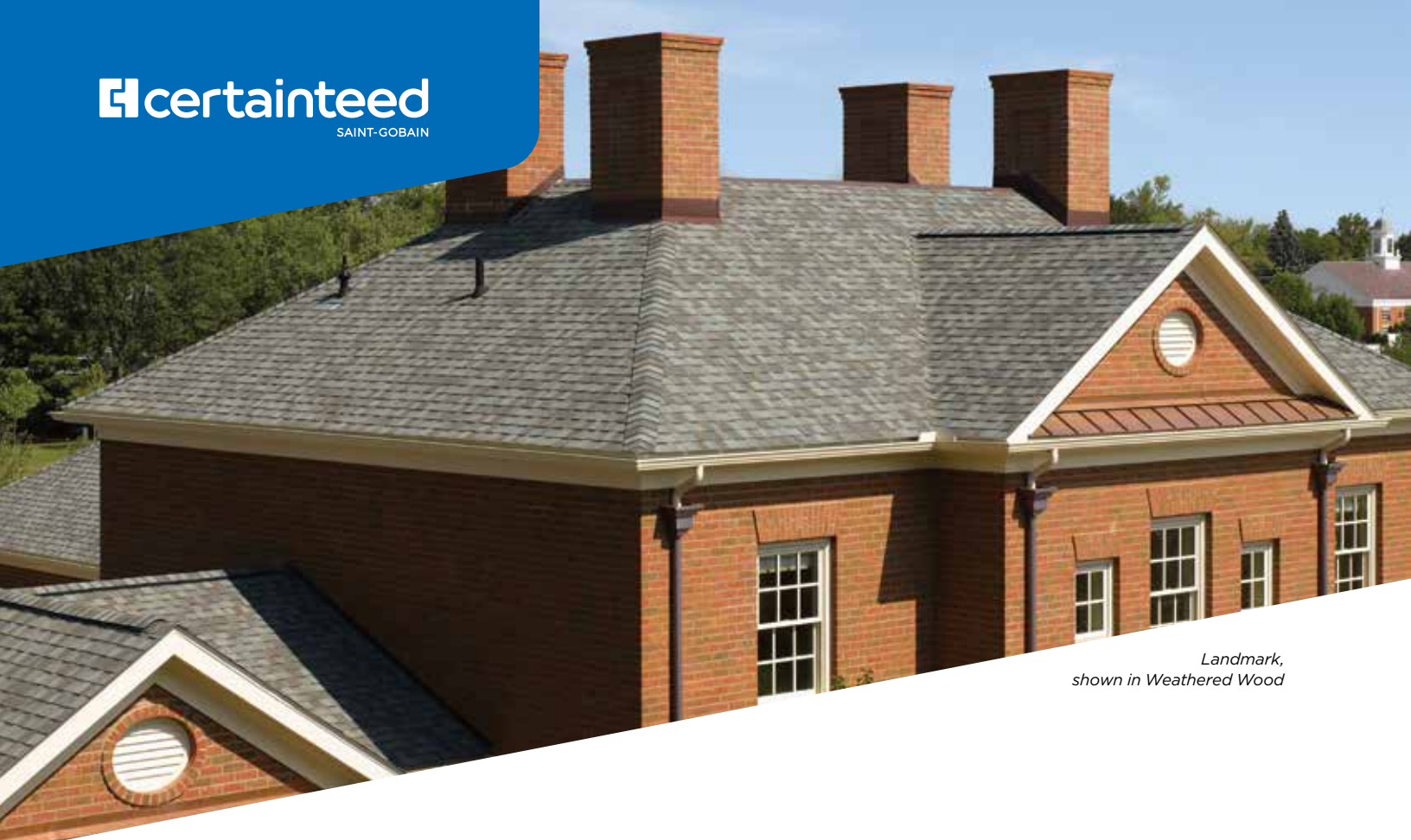
Landmark, shown in Weathered Wood