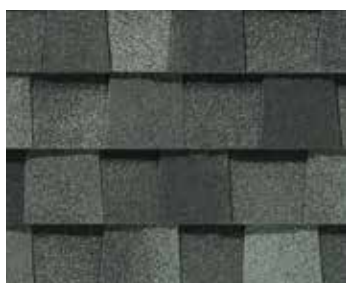
Thunderstorm Gray Available in Utah only