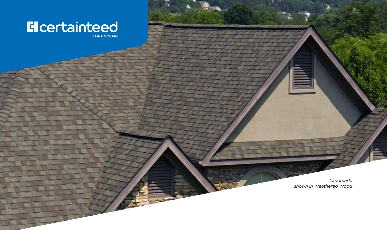
Landmark, shown in Weathered Wood