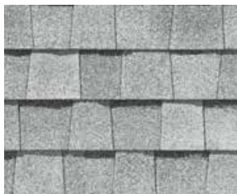
Silver Birch CRR Product ID 0668-0072