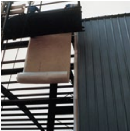
Metal Building Insulation