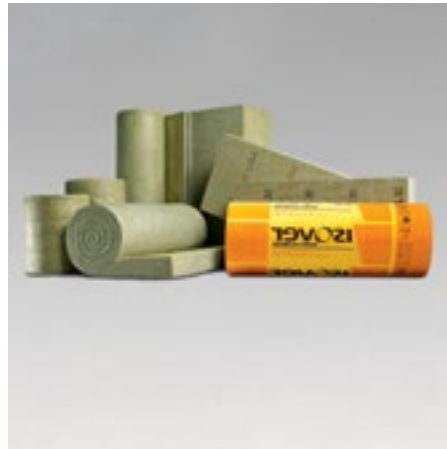
Marine & Industrial