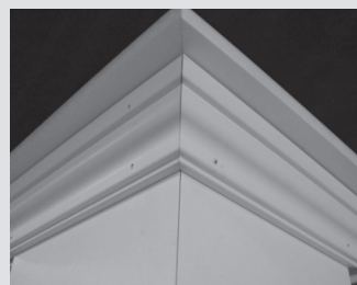
Estate Column base trim