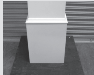
Estate Column top trim