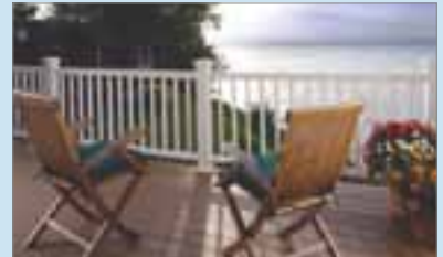
Decking and Railing