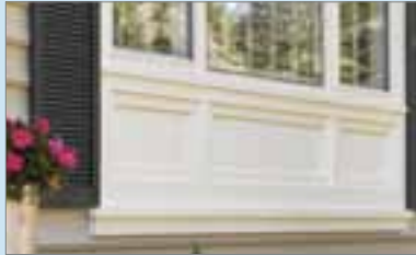
PVC Exterior Trim & Beadboard