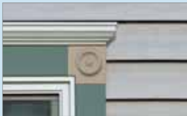
Vinyl Carpentry® Trim