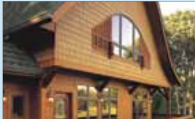
Fiber Cement Siding