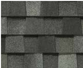
Thunderstorm Gray* *Only available in Utah