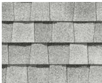
Silver Birch CRRC Product ID 0668-0072