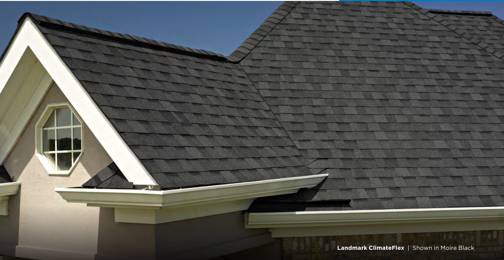
Landmark ClimateFlex | Shown in Moire Black