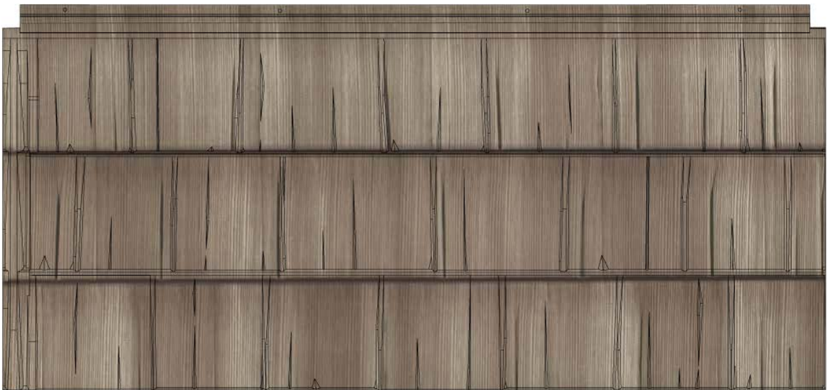
FIGURE 3 –SHAKE PROFILE DETAIL