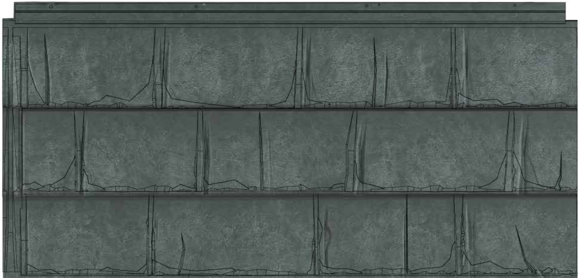
FIGURE 2 –SLATE PROFILE DETAIL