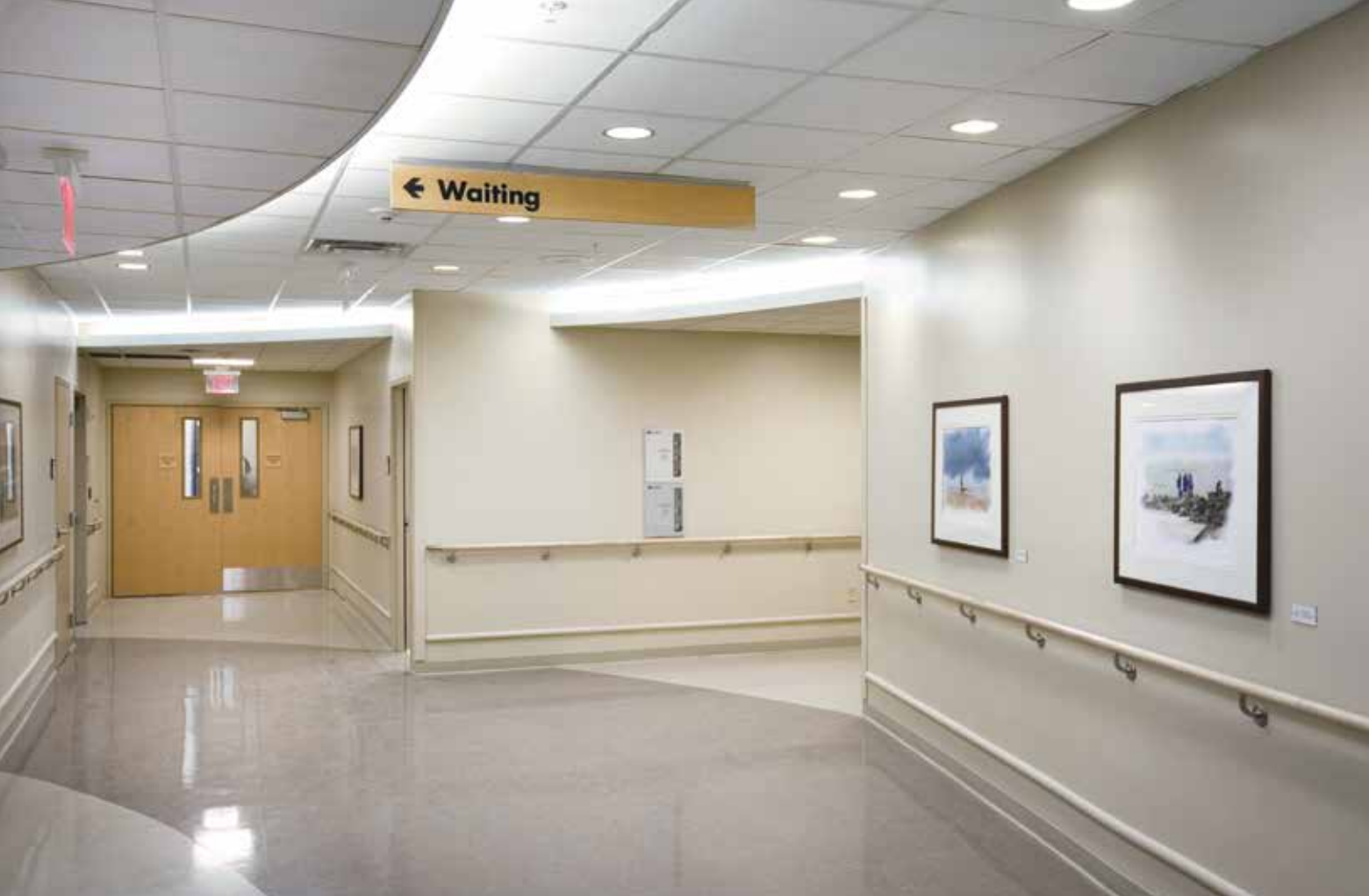
Rx Symphony® m Trim (1222)