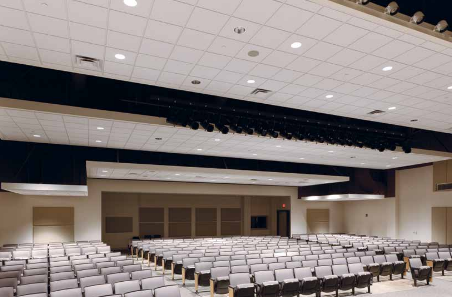
Fine Fissured Reveal (White) (HHF-157)