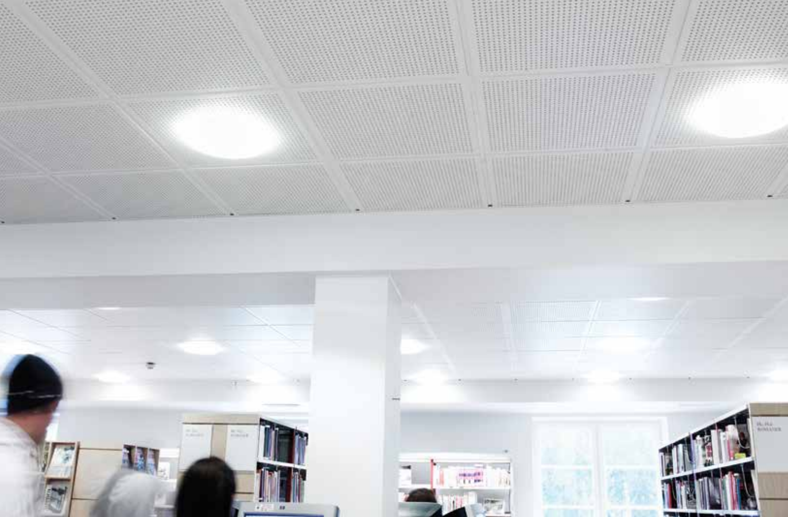
POINT 11™ Narrow Reveal