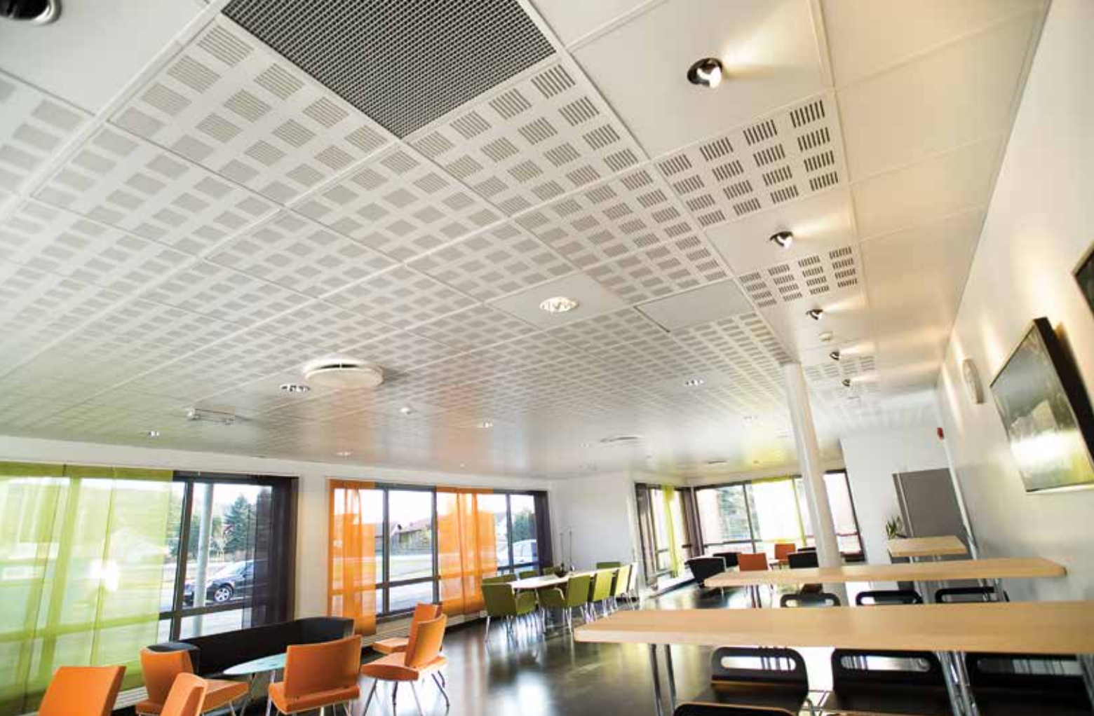
LINE 4™ Trim