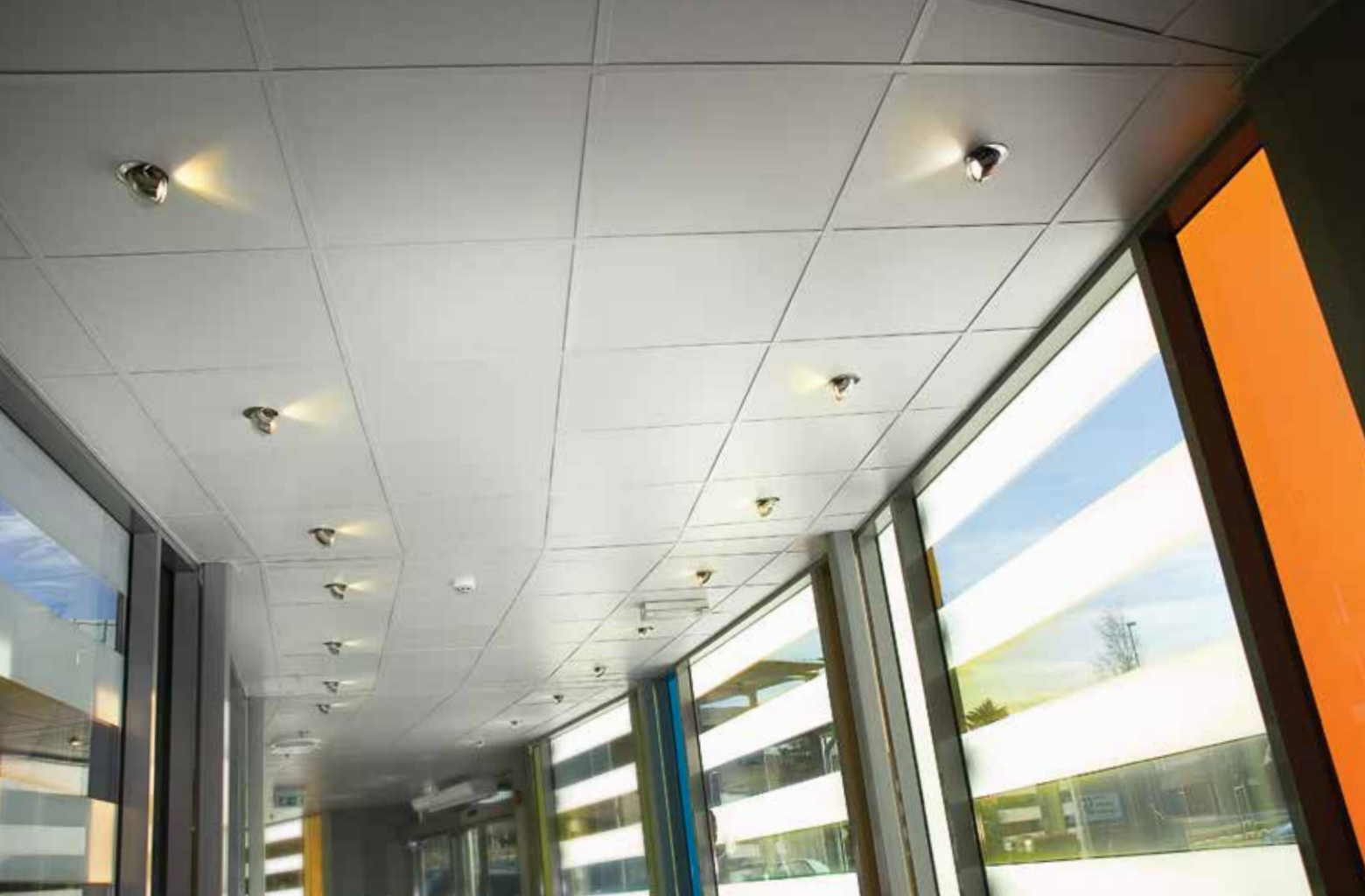
BASE 31™ Trim