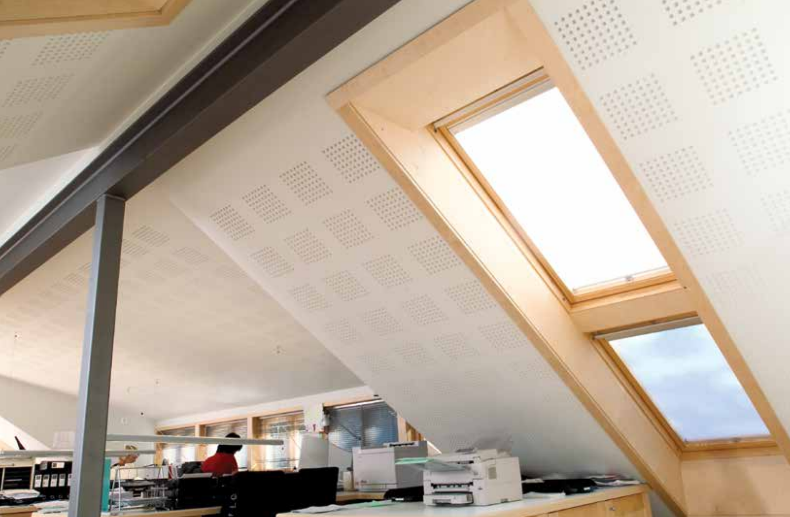
BIG™ Quattro 46