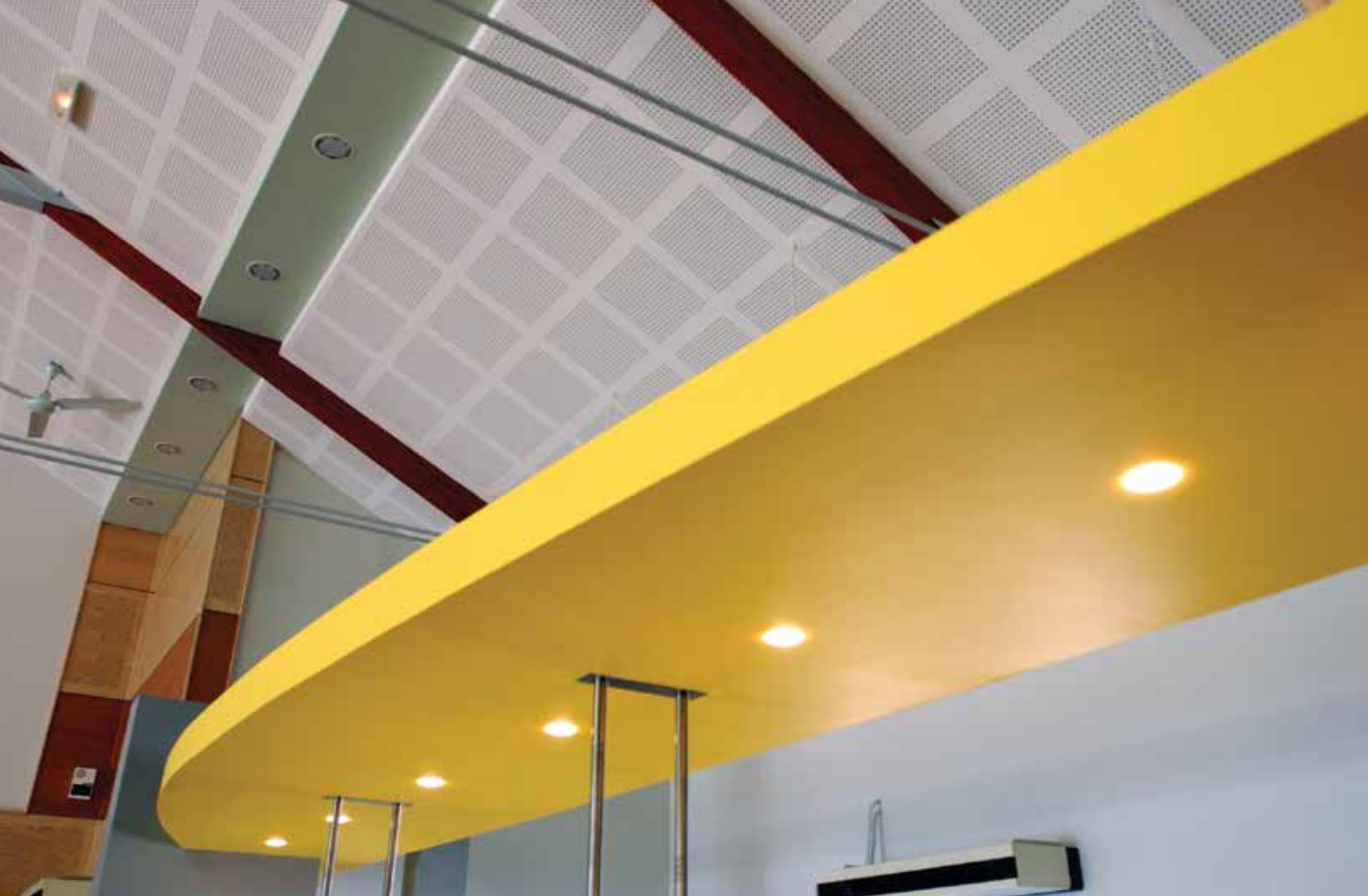
BIG™ Quattro 41