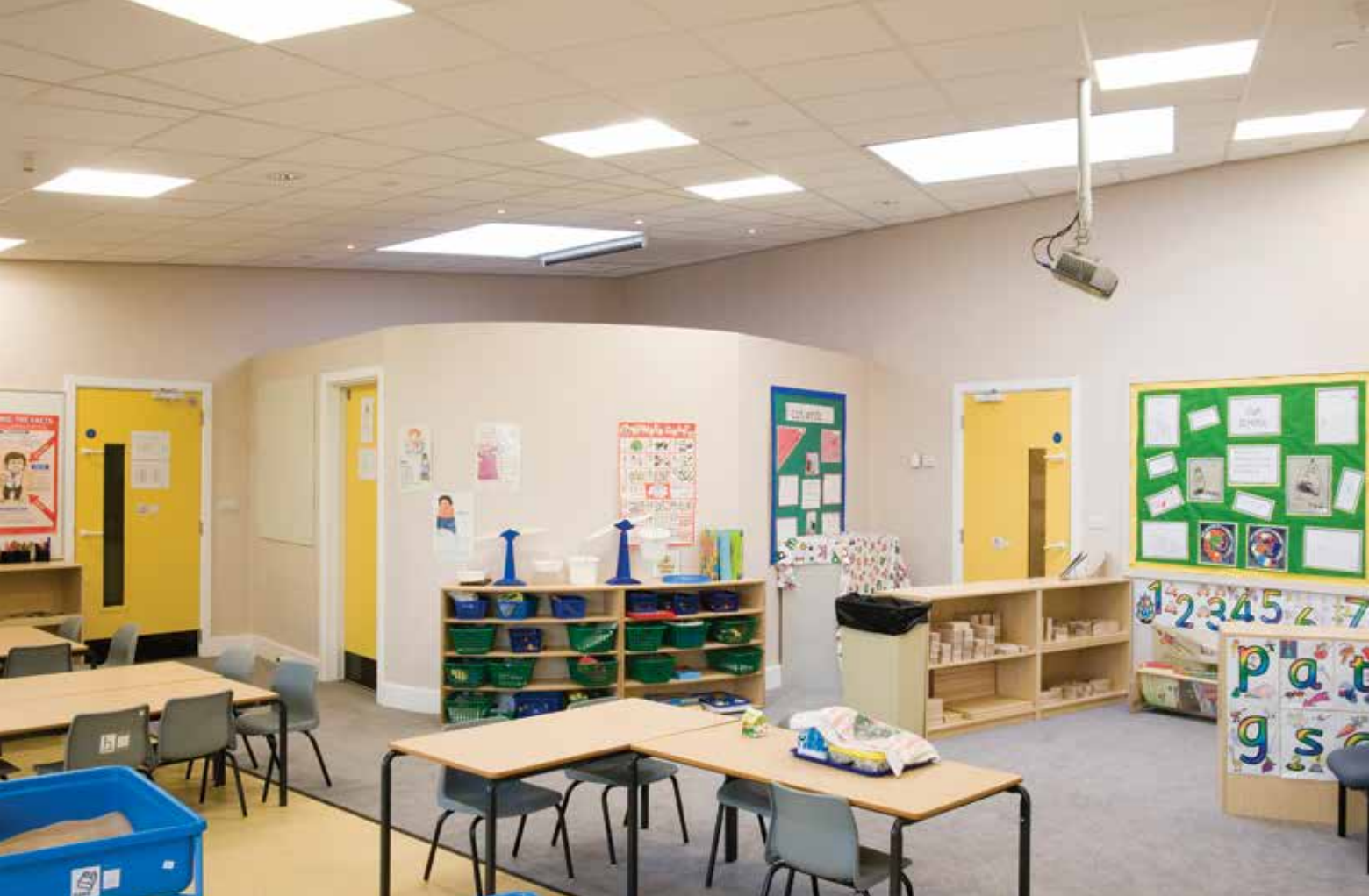
Focus A™ Trim (3540 4607)