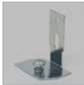
T-Joint Clip CAS-TC