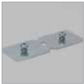
Splice Clip CAS-SP

Visit CertainTeed.com/Ceilings Download HPDs and EPDs LEED® Information / BIM Objects 3-Part Specs / Data Pages