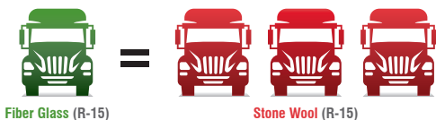
Fiber Glass (R-15)