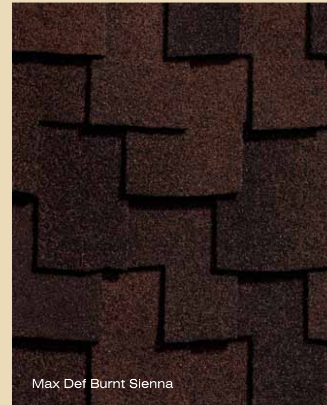
Max Def Burnt Sienna