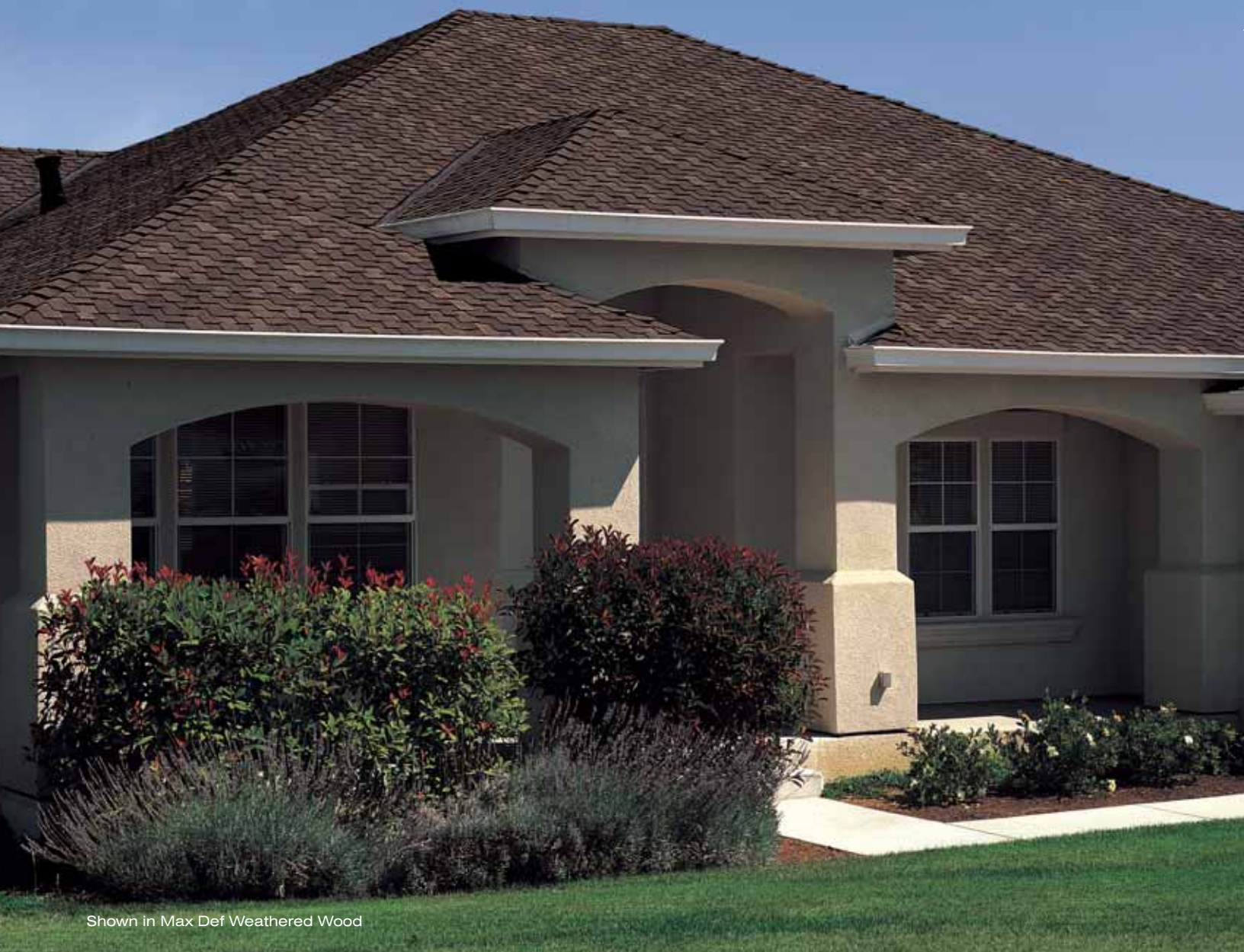
Shown in Max Def Weathered Wood