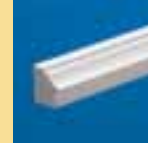
Adjustable Back Band