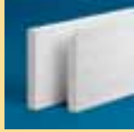
Trimboards Regular & J-Pocket Smooth Woodgrain