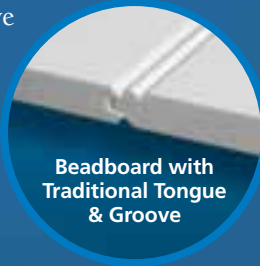
Beadboard with Traditional Tongue & Groove