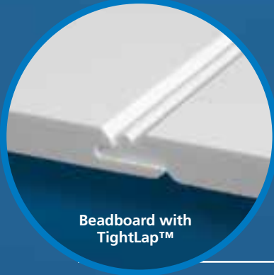
Beadboard with TightLap™

TightLap™ is designed with a larger nailing area with the security of tongue and groove