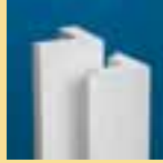
One-Piece Corners Regular & J-Pocket Smooth Woodgrain