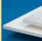
Sheets Smooth Woodgrain