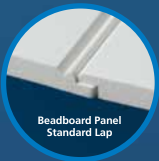
Beadboard Panel Standard Lap

Installs up to 30% faster than standard 5" beadboard