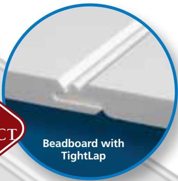
Beadboard with TightLap