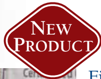
3TL Beadboard— a full 1/3 wider for faster coverage.

Whether you choose 2TL or 3TL, Beadboard with TightLap delivers better hold with a larger concealed nailing area, and sturdy tongue and groove connections.