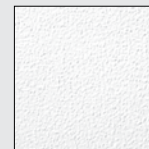
WHITE CRF – CRF-1