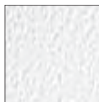
WHITE ELITE VINYL ELT-1 (LR=0.82)