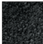
BLACK NUBBY NBY-5 (LR=N/A)