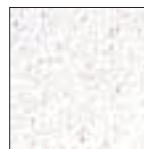
WHITE NUBBY NBY-1 (LR=0.84)