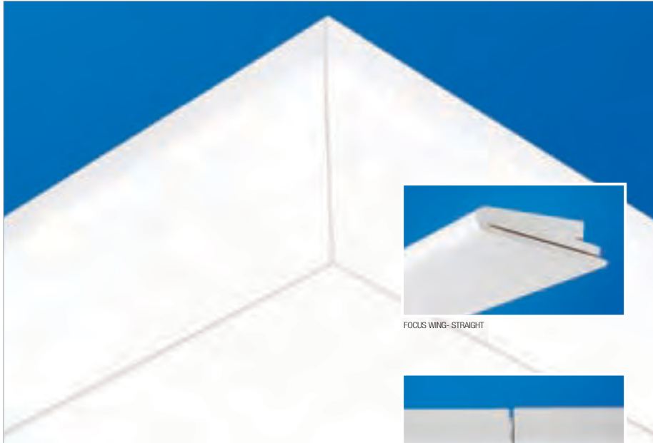
ECOPHON FOCUS WING INTEGRATED WITH ECOPHON FOCUS Ds.

ASTM E 1264 Classification: Type XII, Form 2, Pattern G, Fire Class A